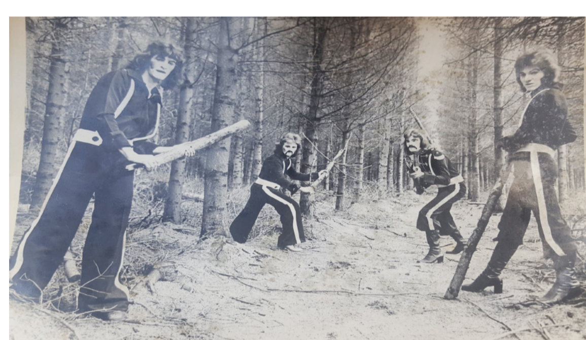
White Powder Toys.