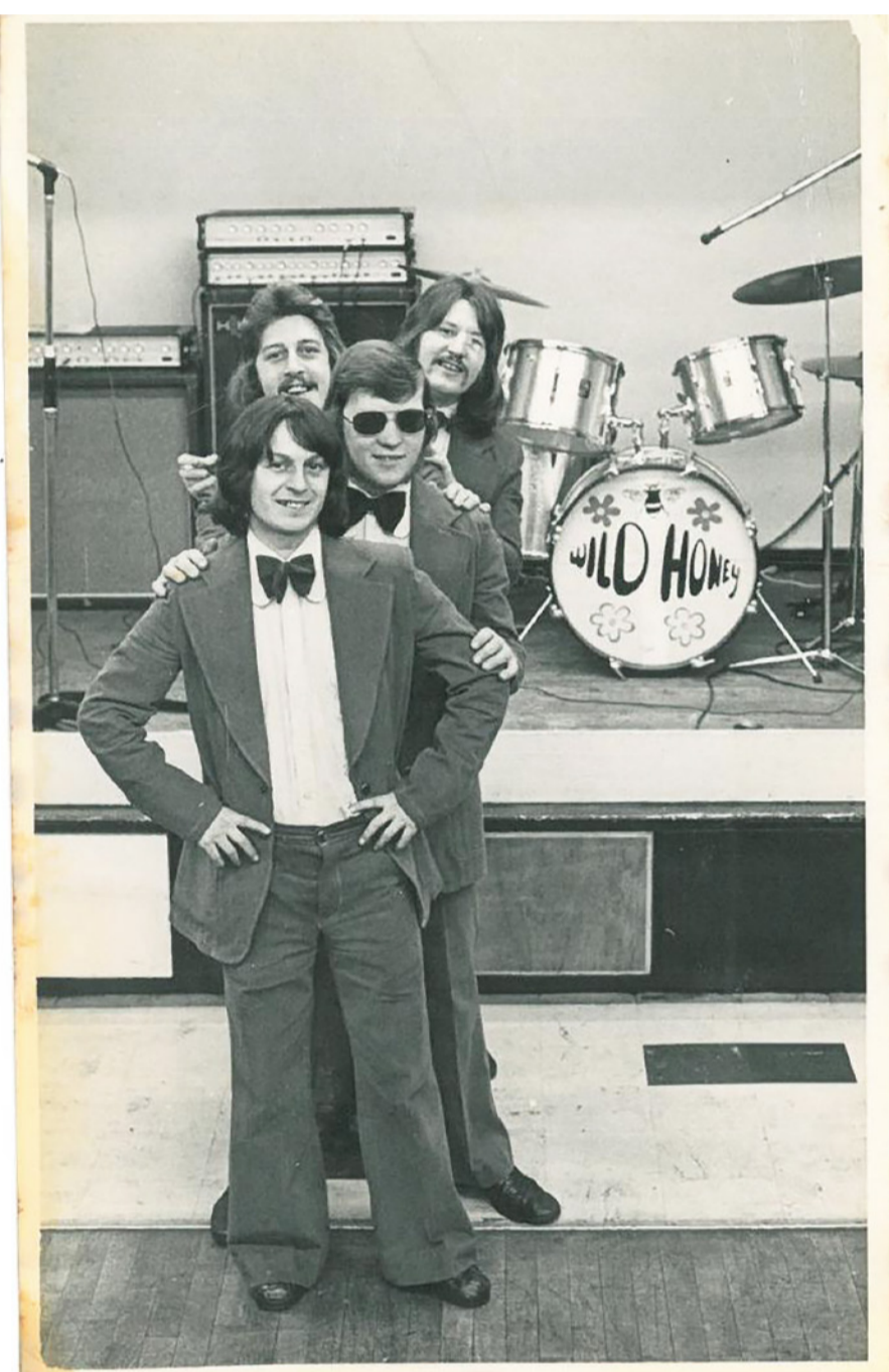
Wild Honey in 1973.