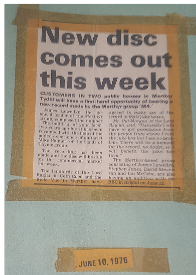
Advert for a single released by M4.